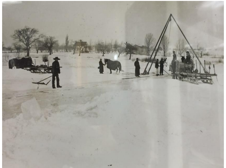
Cutting ice on the Lake (Does anyone know which one? My guess is Plunkett.)

That's it for now. Have a Happy St. Patrick Day , and think spring.