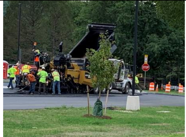
8/28 Top Coat Paving Student Parking Lot 7:00 AM