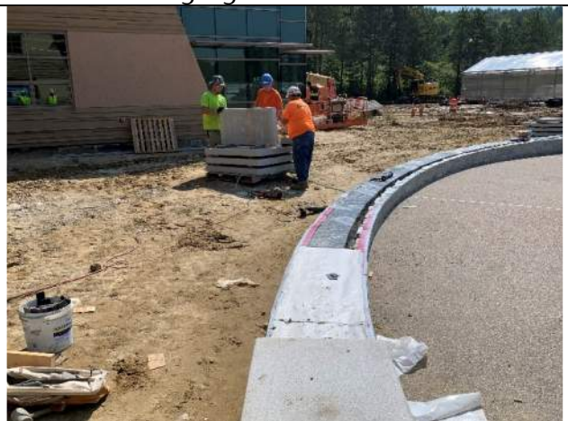
8/26 Masons Prepping the stone seating