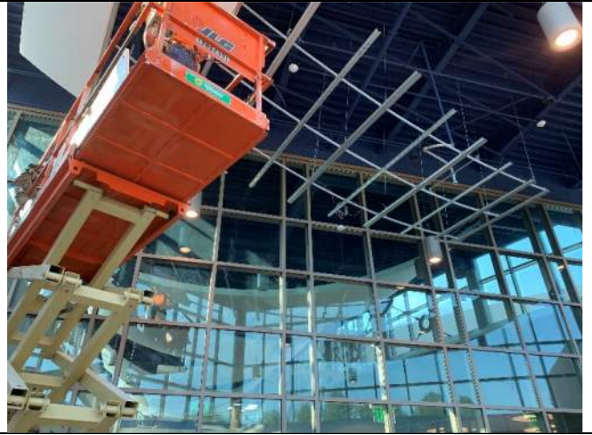
8/27 Two Ceiling Clouds Left to Finish