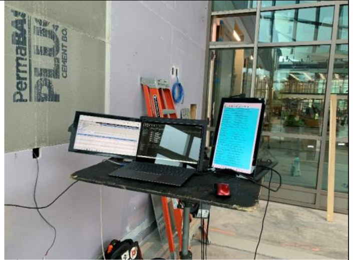
8/23 Fire Alarm Testing (Today Passed)