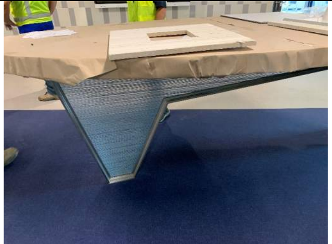
8/25 Collaborative work stations