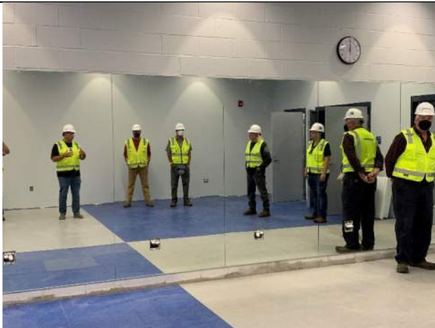
8/28 Representative from Towns Tour the building today, Fitness Room above, note the mirrors installed this week.