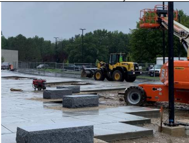
8/23 Granite Benches In Front of School