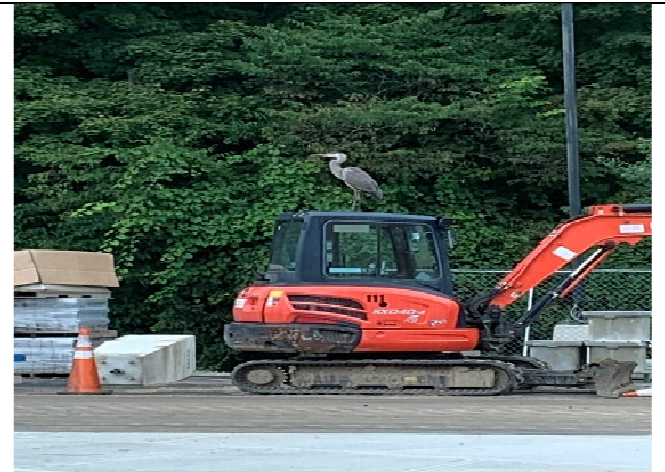
8/28 Another guest stopped by the site Saturday but did not take the tour. A Great Blue Heron, I believe. Roost on the excavator.