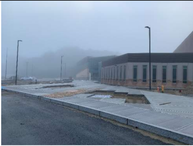
8/24 Front Plaza Early in the morning