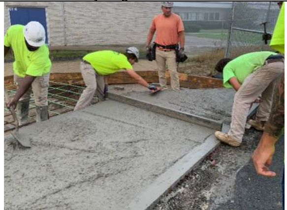
8/24 Real Action Shot of the Finishers