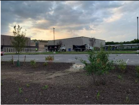
8/28 A great day to pave not as hot and less humid