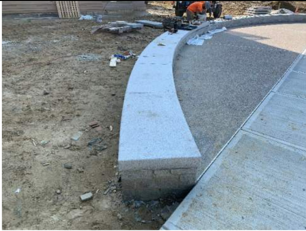
8/27 Seating Progress