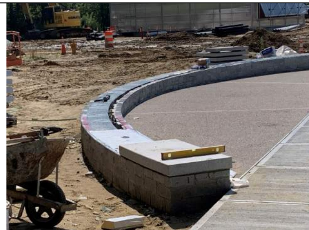
8/26 Outdoor Classroom Seat Stone Installation