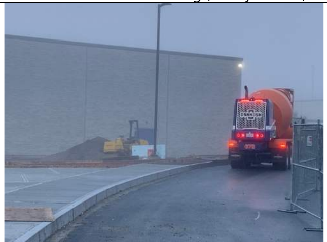
8/24 Early Fog for Concrete Pour