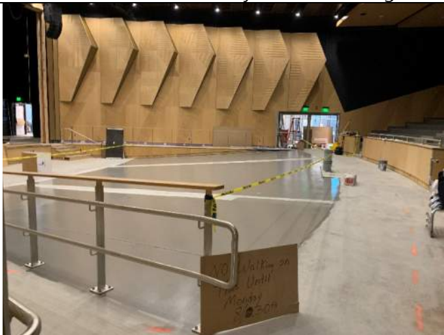
8/25 Auditorium Epoxy Finish Before Seating