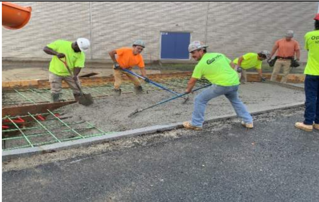
8/24 Action Shot of Concrete Finishers. No Posing for the camera allowed.