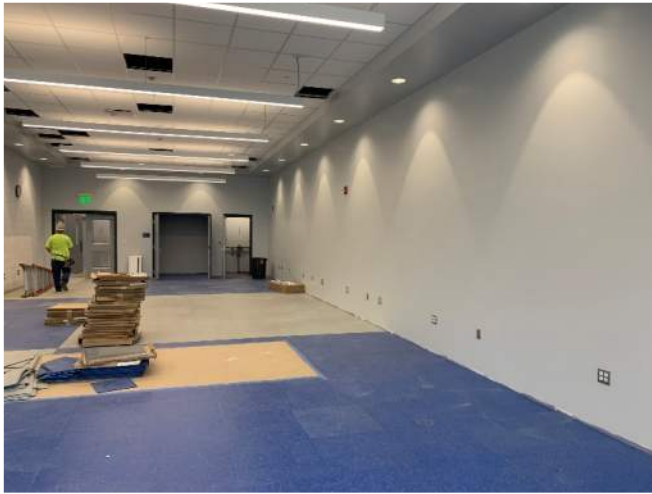
8/23 Fitness Center Ready for Mirrors

The next weekly construction meeting scheduled for Wednesday 9/1/21. Via Web Ex.