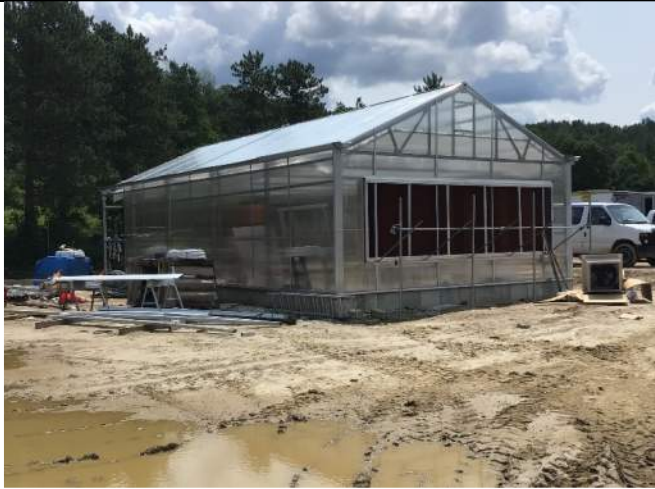
7/22 Greenhouse Nearing Completion