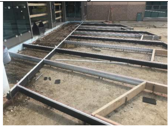
7/21 Framing for Exposed Aggregate Concrete at the Main Entrance