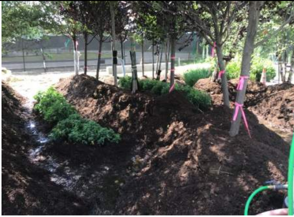
7/23 Landscape Trees Delivered