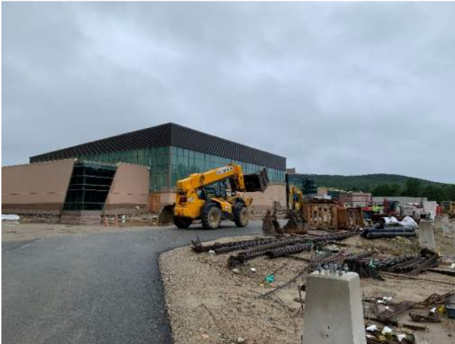
7/19 Overcast, Wet, Soggy