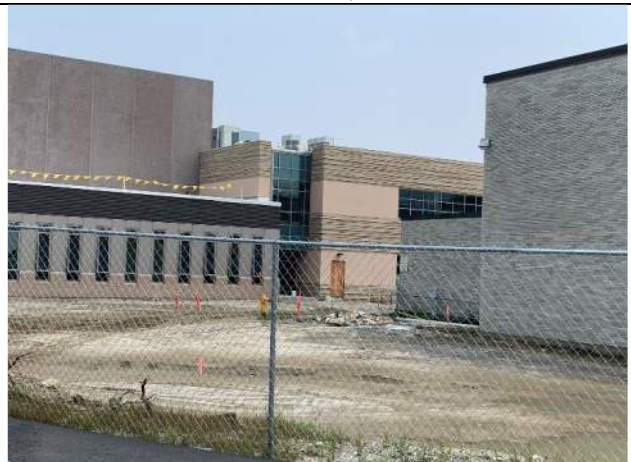
7/20 Grade Raising West Elevation