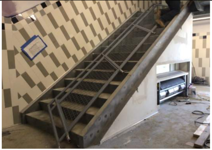
7/22 Stair 2 Railing System Installation