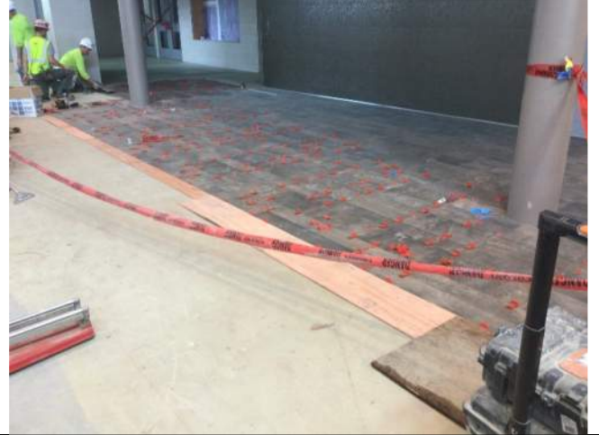
7/23 Main Street Floor Tile Installation Begins