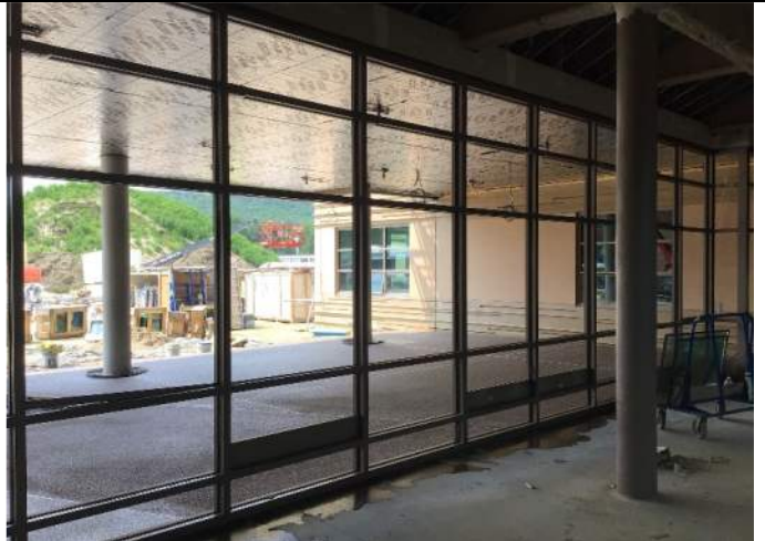
7/22 Looking out from Student Commons