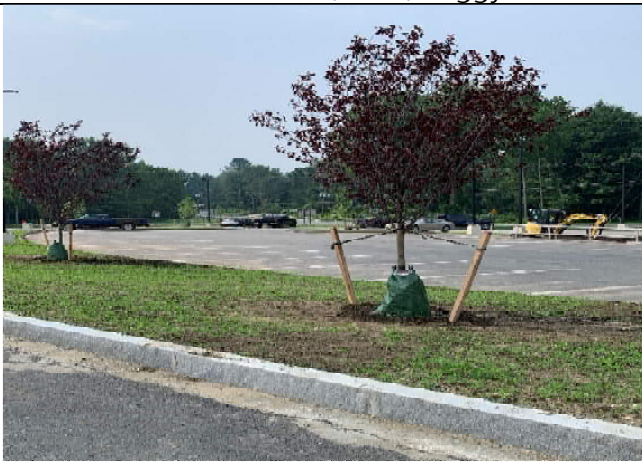
7/20 Plantings at Student Parking Lot