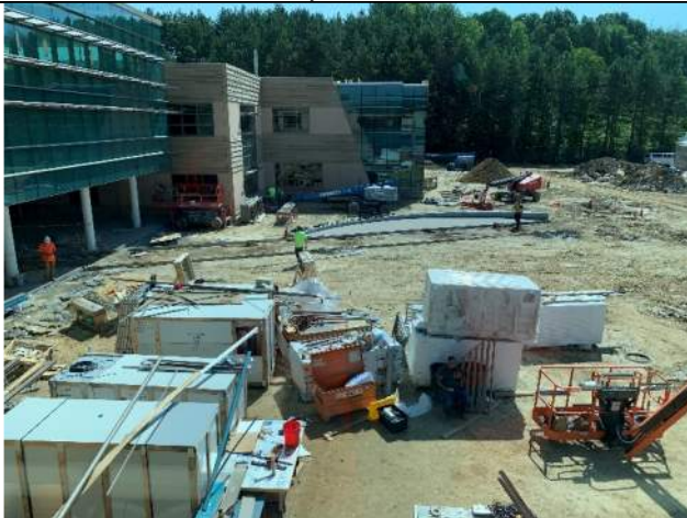
7/24 South Entrance Looking Down from C2