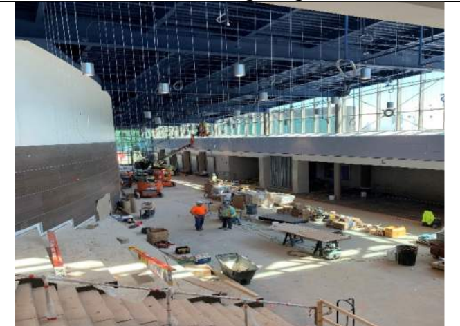
7/24 Main Street Clean Up