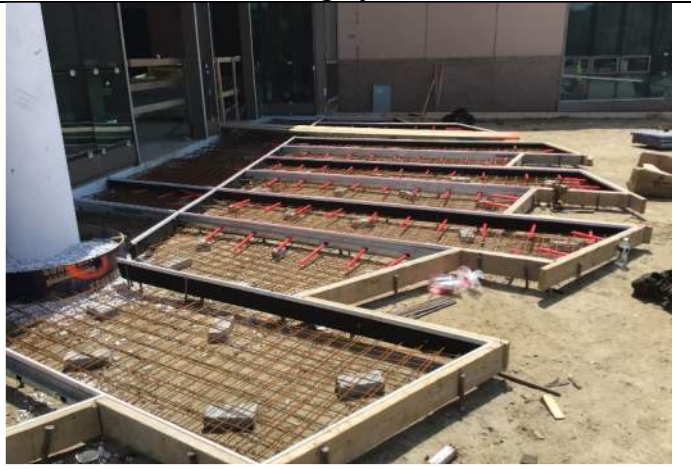
7/23 Entrance Formed and Ready for Concrete