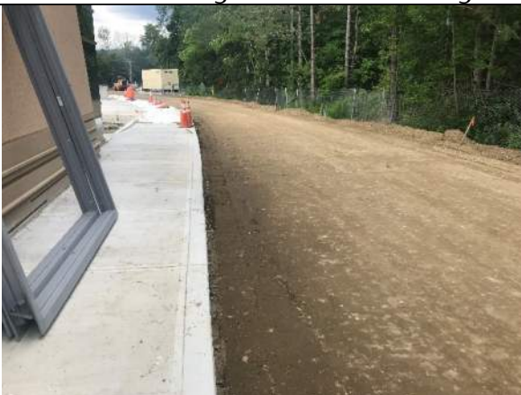
7/21 West Side Compacted for Bituminous Base