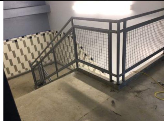
7/23 Rail System Installed