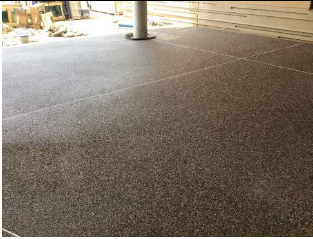
7/22 Exposed Aggregate Concrete Outdoor Seating Area. Beautiful!