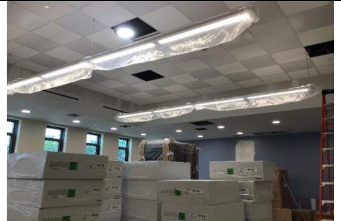
7/22 Band Room Lighting Installed