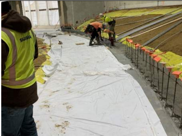
1/27 Auditorium Concrete Protection