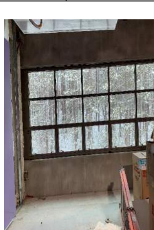
1/27 A Room with a view Area D Corner