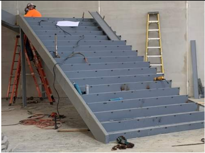
1.25.21 Main Stair