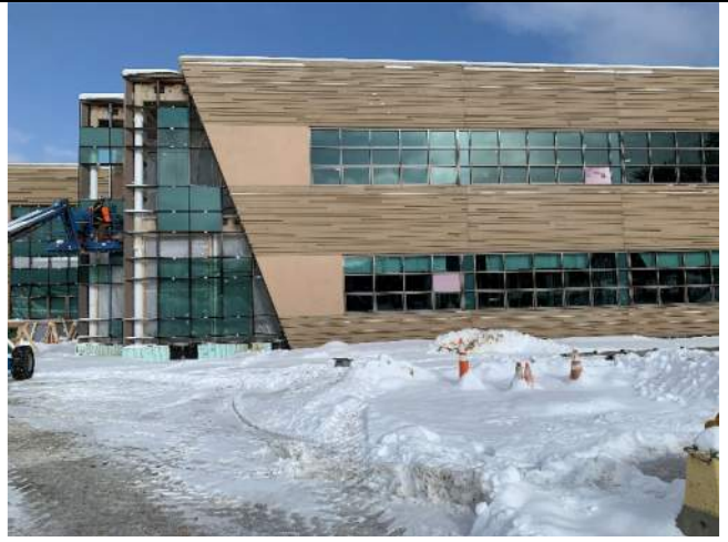
1/28 Area C Curtain Wall Corners