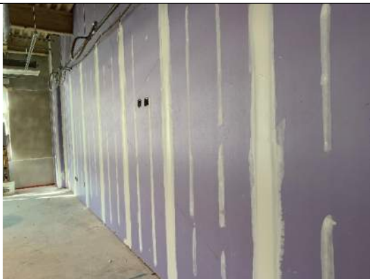
1.25.21 Taping of Gyp Board