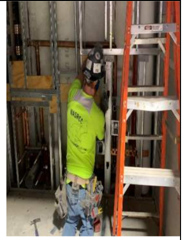
1/27 Pipe Insulation and Bathroom Rough In