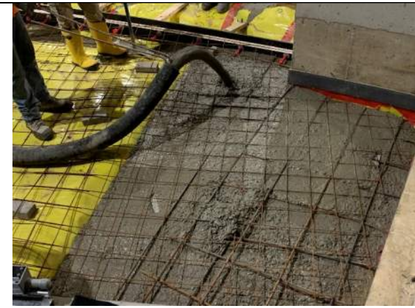
1.26.21 Auditorium Pour in front of stage.