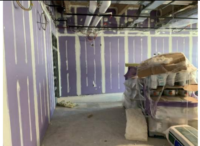
C2 1.25.21 Taping Gyp Board