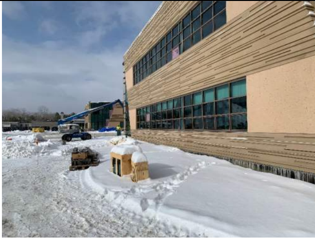
1/28 Area D Glazing Nearing Completion