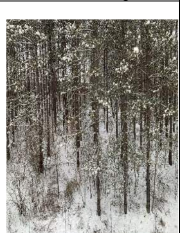
1/27 A Berkshire Classroom for sure