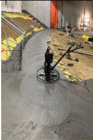
1/26 Concrete Finish Isle Between Slopes