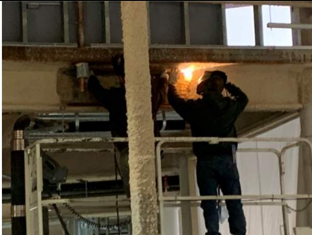
1/27/21 Beam Penetration Near Fitness Room