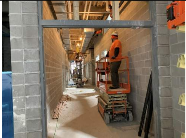
1/27 MEP Installations Near Locker Rms.