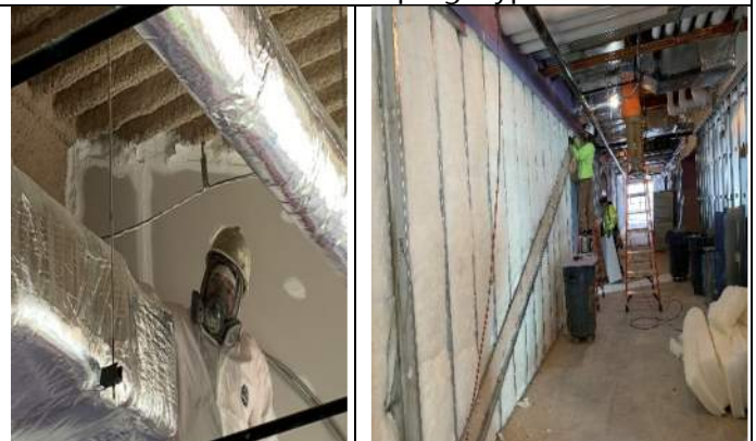
1.25.21 Acoustic Caulk and Acoustic Insul. C2